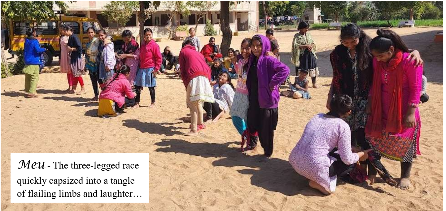
Meu - The three-legged race quickly capsized into a tangle of flailing limbs and laughter...